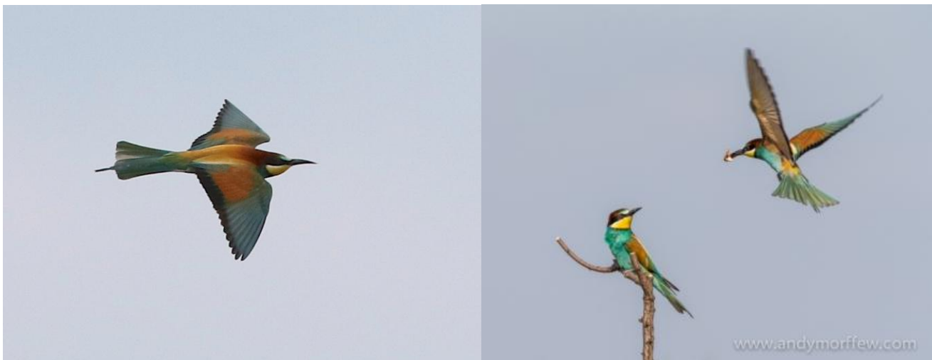
European Bee-eater