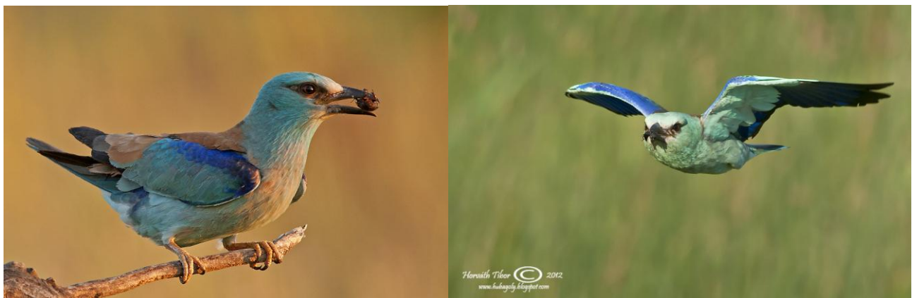
Eurasian Roller