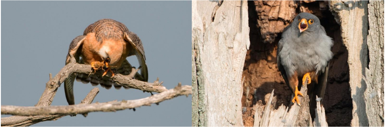
Red-footed Falcon female and male by Joerg Mager