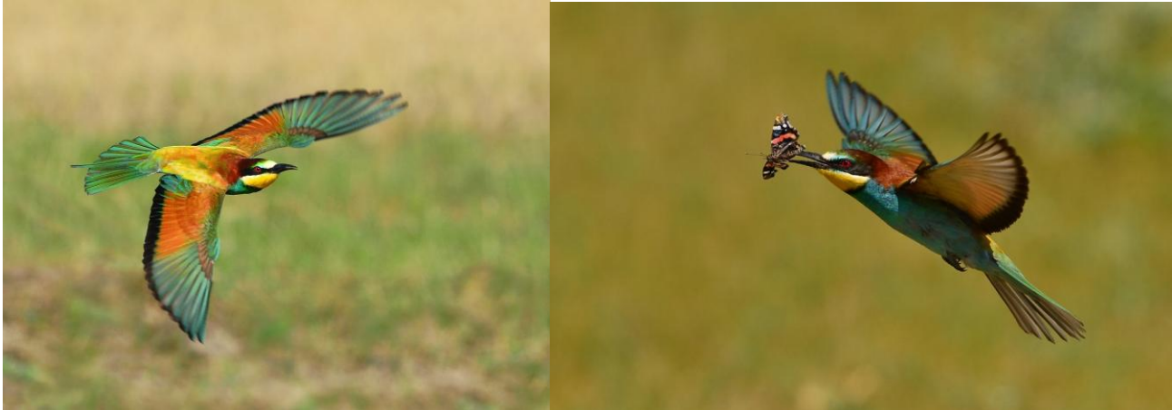
European Bee-eater photos by Eric Muller, mobile hide