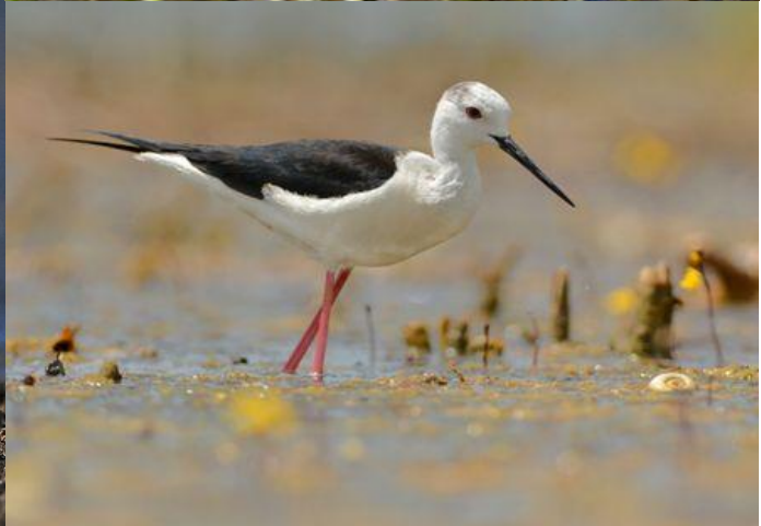
Black-winged Stilt by Tibor Horvath & Eric Muller; Blue-headed Wagtail female by Eric Muller at top