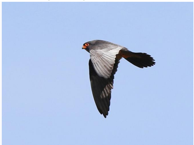
Red-footed Falcon males at Kondor