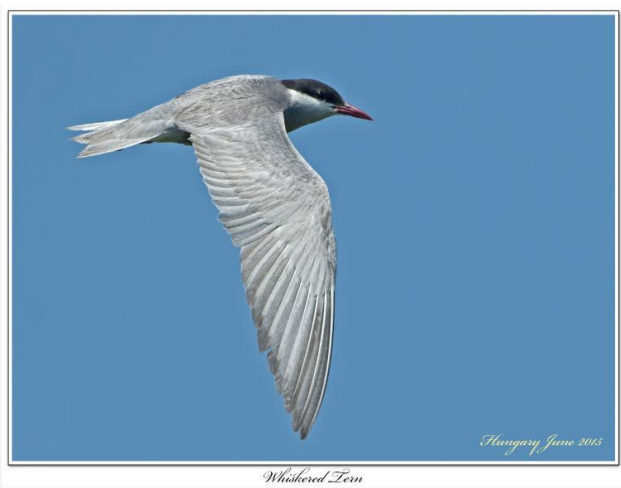
Pygmy Cormorant & Whiskered Tern