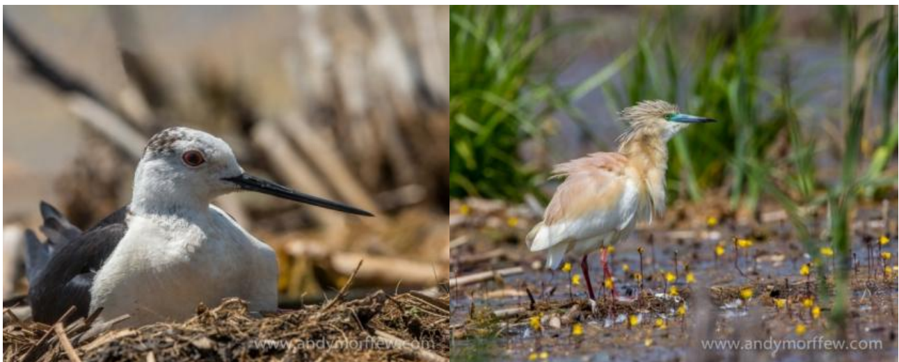
Black-winged Stilt & Squacco Heron