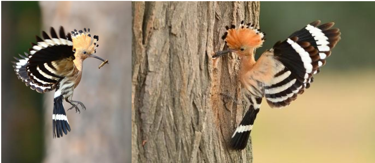
European Hoopoes from mobile hides