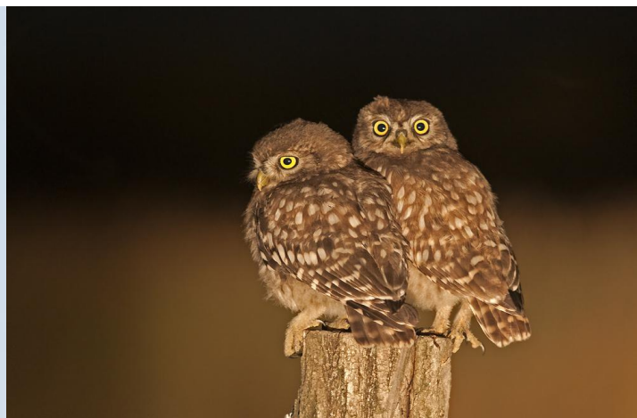
Little Owl photo by Andy Morffew ; Little Owls by Tibor Horvath