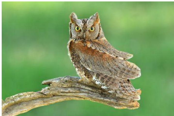
Scops Owl