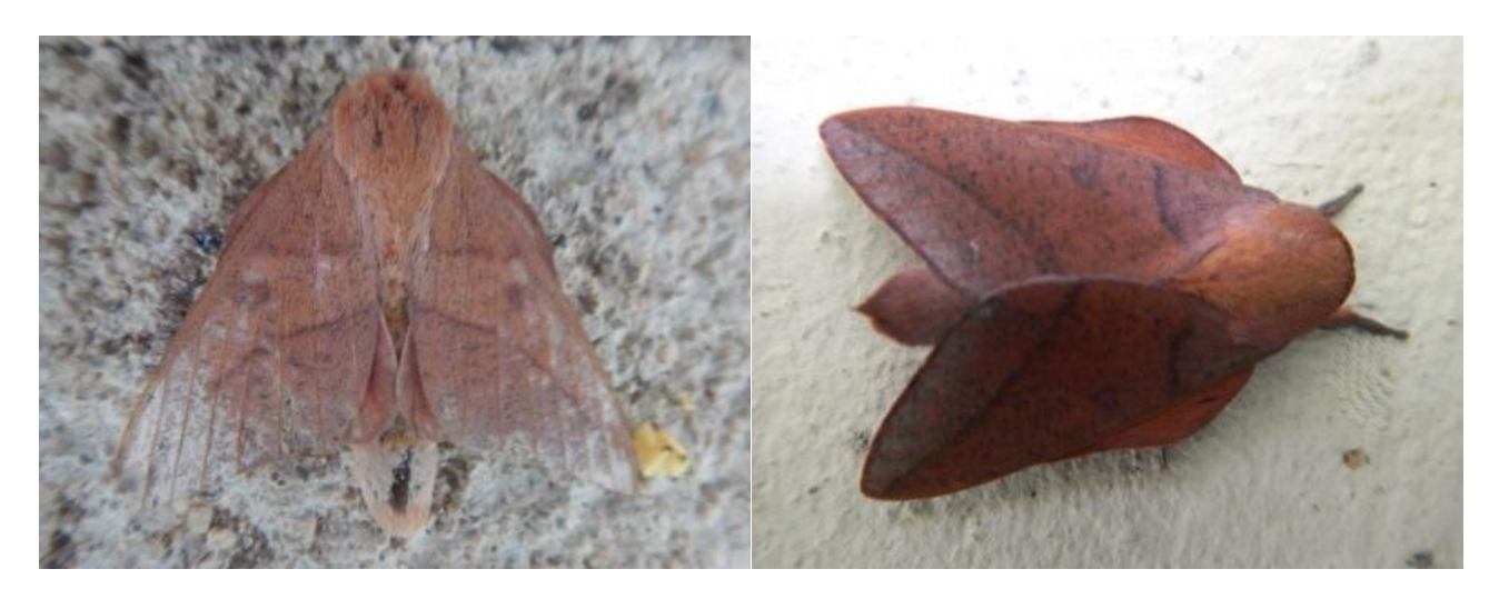
Finally we travel back to Freiburg and continue our journey back to the lodge. After arriving back soon we have our last supper together during this holiday. We also check the moth trap again tonight where there is always a great variety of species from the huge Rothschildia aurata till the tiny Trosia nigropunctigera .