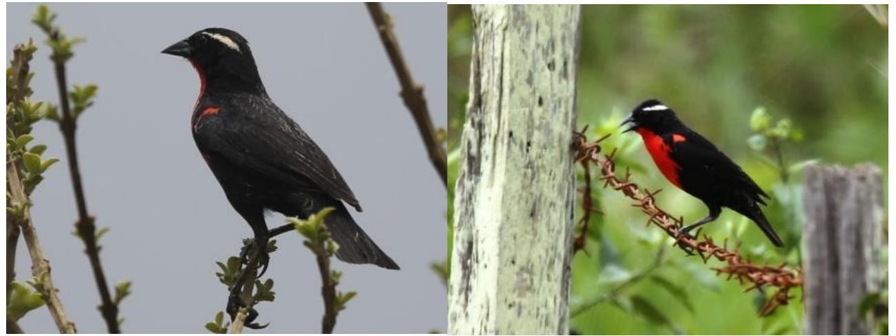
After the meal and some ice-cold refreshments

we are ready to discover more and can find the stunning White-browed Meadowlark, Short-crested Flycatcher, Pileated Finch, White-tipped Dove and Olivaceous Woodcreeper.