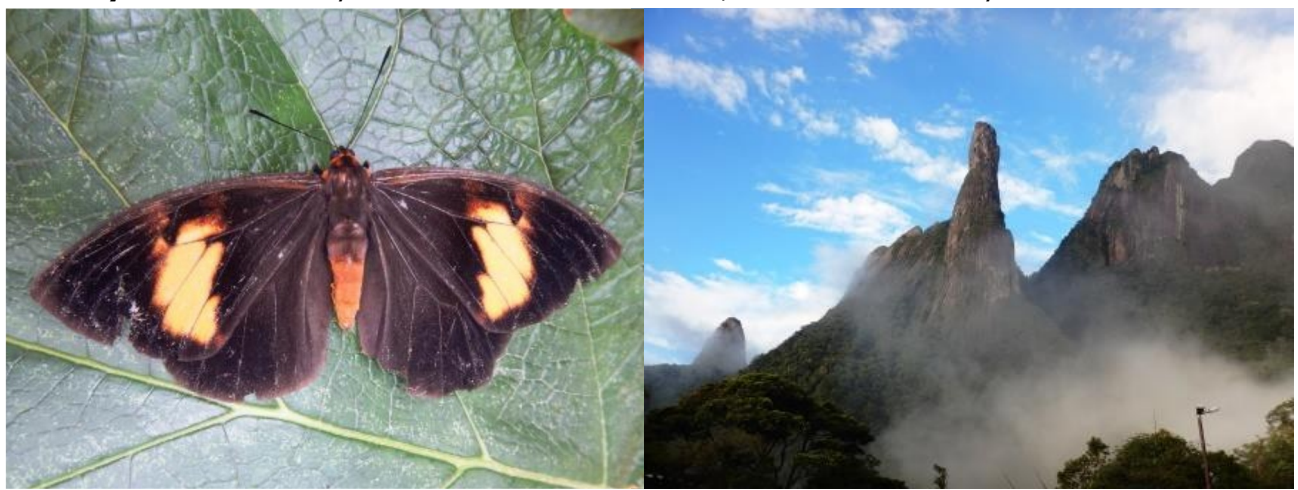
2nd Day Excursion to dry Atlantic Forest near Carmo, 3toed Jacamar Day

Today we should be up early, ready to have breakfast at 6am so we can start half an hour later for a full day long adventure to a dry Atlantic Forest area. On the way a bit more than an hour away we stop at a picturesque point with huge rocks which the locals call God's Finger Rock . The weather can change quite quickly here, but almost always you can have a good bird activity with regional endemic Green-headed Tanager and endemic Yellow-winged or Golden-chevroned Tanager , near-threatened Azure-shouldered Tanager . More common species can be around as well such as Streaked Flycatcher , Black Jacobin , House Wren . They all love the lilac-flowered beautiful, but otherwise poisonous Manacas trees which flower at this time of year.