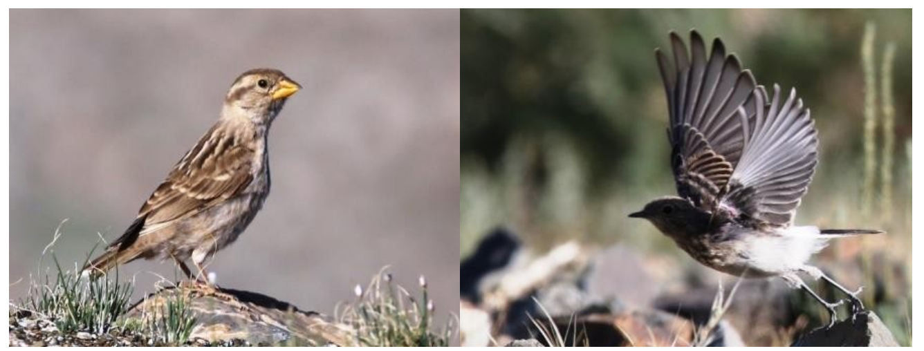
Later on beside the usual species we had some Common Whitethroat, Rufous-tailed Rock Thrush and found a Eurasian Nightjar which we even could photograph.