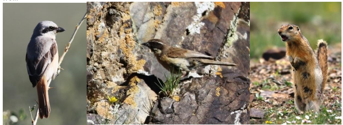
A dark morph Long-legged Buzzard was new. We tried another lookout point as well where we found a beautiful pair of nesting White-winged Redstarts.

One morning Dorothy found an Asian Desert Warbler. After breakfast we drove up above 3000 meters. On the way Brown Accentor, Saker Falcon and Pale Crag Martin was new. Two immature Steppe Eagles gave us a nice flight show and we had our first Water Pipit as well.